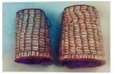
Plate 4: Khap